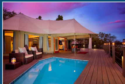
CAPE TOWN AND JOHANNESBURG, SOUTH AFRICA